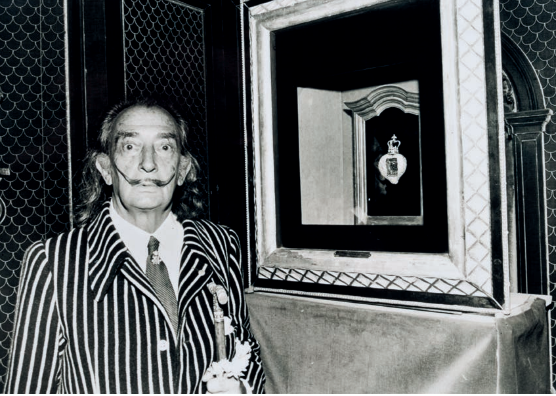
Salvador Dalí in the jewels exhibition held at his Theatre-Museum, 1973